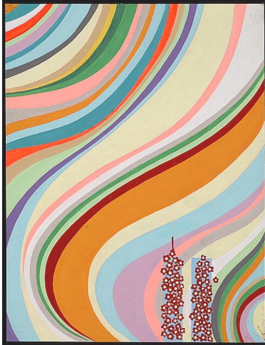
Kim, Jen. World Trade Center Towers Covered with Flowers. acrylic, color. 2001.