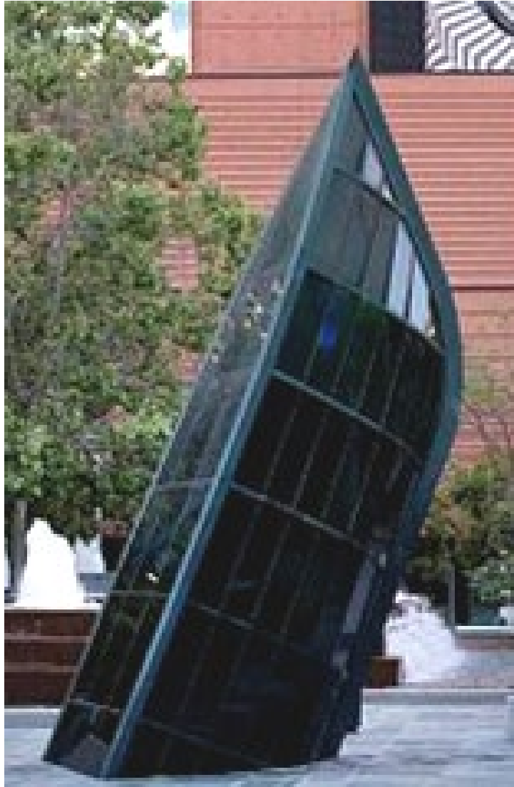
San Francisco Museum of Modern Art, San Francisco, California, photograph, 2012